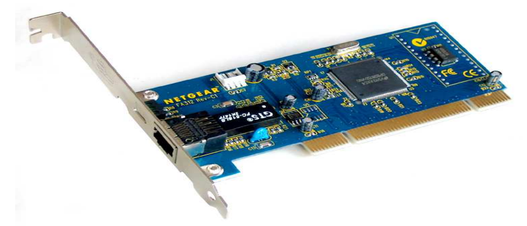
Fig 2 NIC Card Hardware structure